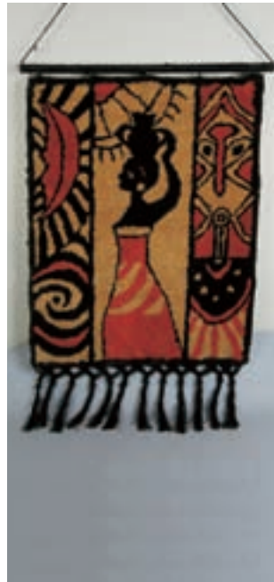
Carpet wall hanging of a Negress, c1960, 98cm high, 58cm wide.