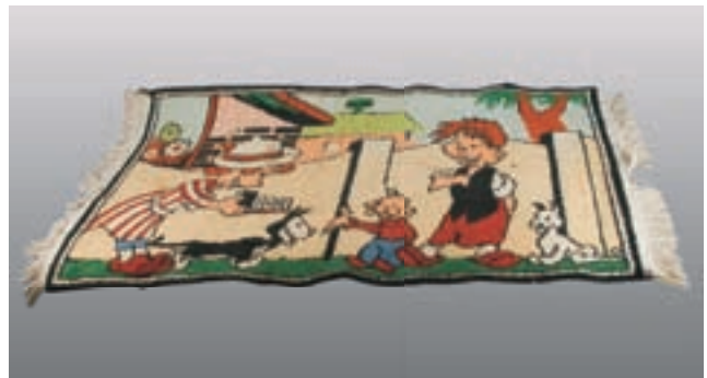
Ginger Meggs floor mat, Australia, c1950, 5.5cm wide, 94cm long.