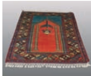
Double knotted rug, handmade in Central Anatolia, 'Konya Ladik' prayer rug, using natural dyes and handspun wool on wool, Turkey, c1960, 112cm wide, 202cm long.