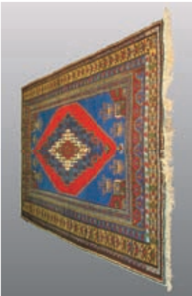
Double knotted rug, handmade in Central Anatolia, 'Taspinar' using natural dyes and handspun wool on wool, Turkey, c1970, 162cm wide, 322cm long.