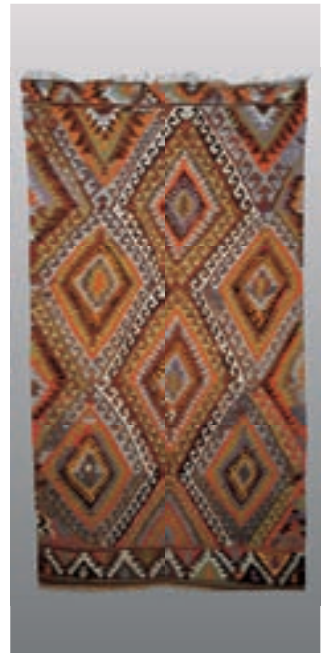
Kelim woollen warp and weft, Turkey, c1970, 153cm wide, 206cm long.