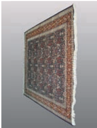
Handmade, 'Hereke' piece using natural dyes and handspun wool on cotton, Turkey, c2000, 209cm wide, 307cm long.