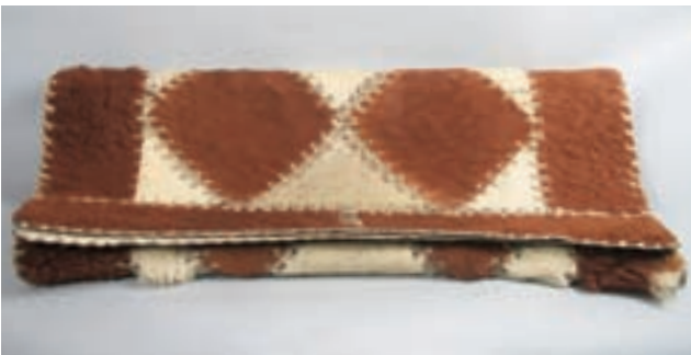
Cowskin patchwork rug with leather thong seams, Australia, c1975, 70cm wide, 137cm long.